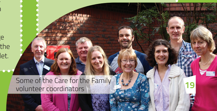
Some of the Care for the Family volunteer coordinators

Find out more about Home for Good and how you can get involved at www.homeforgood.org.uk .